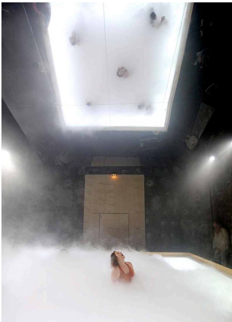
Paradise Ruhrtriennale Festival

Through our work we raise the profile of original devised work, which is not reliant on adaptation. One of our key aims is to address the imbalance of engagement opportunities offered to children and families to experience immersive, interactive and site-specific events.