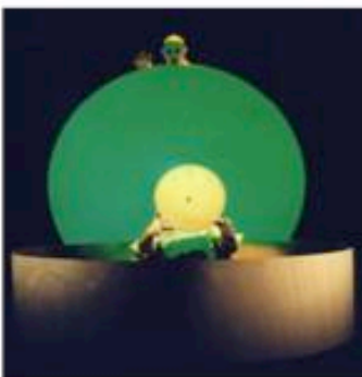
In One Ear